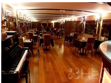
Room on upper deck