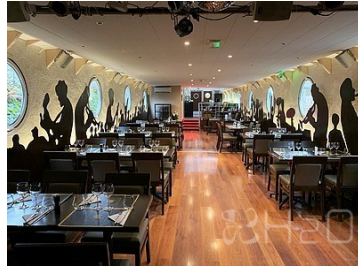
Salle de restauration