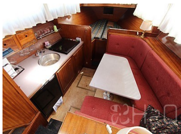
Dinette and kitchen