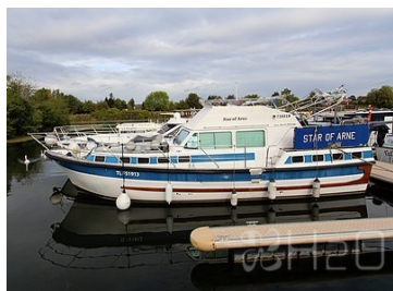
Star of Arne